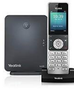
Yealink DECT Cordless