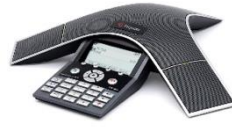
Polycom SoundStation Conference Phones